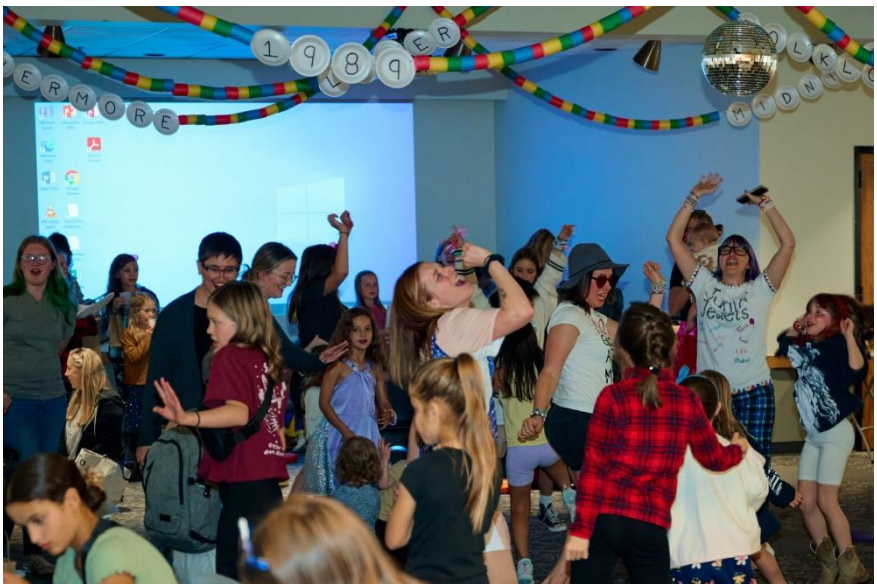
Dance Party at Taylor Swift Night at the Library

grandparents, dressed thematically. One family shared their gratitude for the free, all-ages event that let their whole family share the experience together, noting that most Taylor Swift activities were too expensive for them to all participate in.