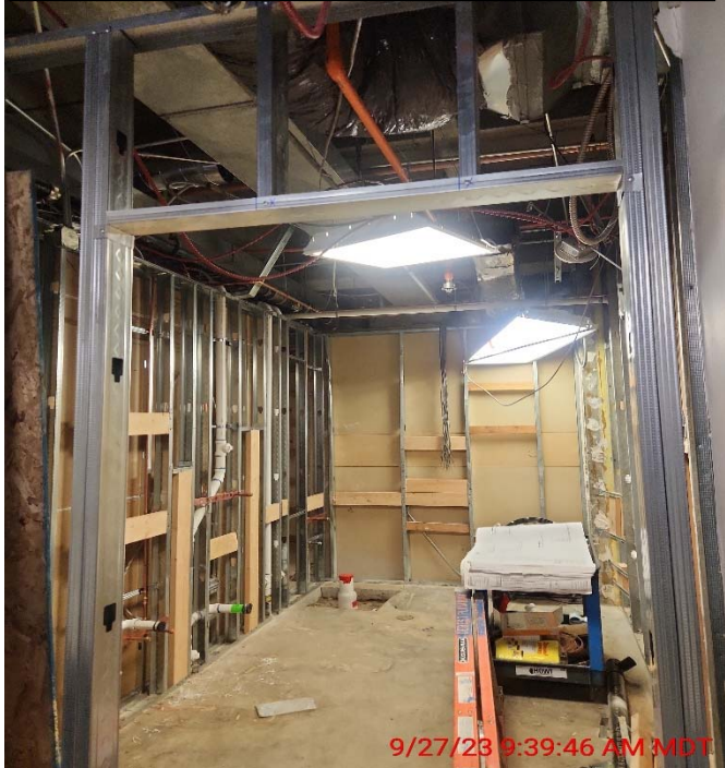
1st Floor Restroom/ Plumbing Line Renovations