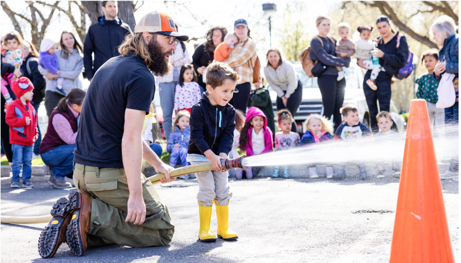
Community Helper Storytime

Discover the Library’s wide variety of programs for community members of all ages and interests! From engaging storytimes for kids to hands-on workshops for adults, there’s something for everyone. Visit us across our five branches and stay connected by checking out BoisePublicLibrary.org or calling us at (208) 972-8200.